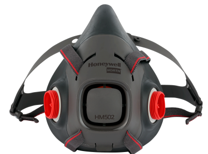
HM502, drop-down version